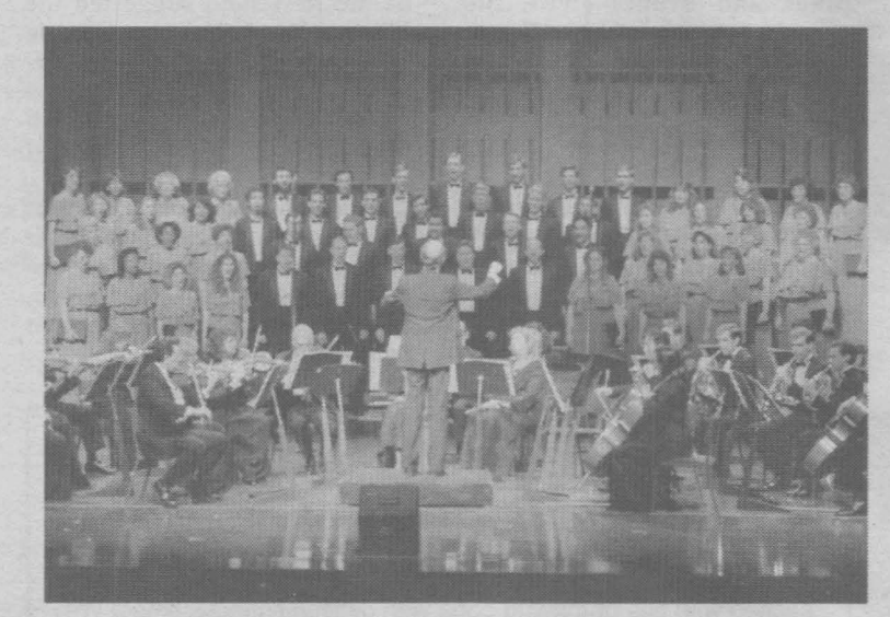
MUSIC SPECTACULAR—The five Pasadena churches combined for their annual spring concert March 24 in the Auditorium. The concert featured the Pasadena Church Choir, the men's and women's choruses, the Pasadena Orchestra and a women's ensemble.

Let's continue to work together in the bond of Christian love and unity, praying for one another and for the work God has called us to do. My prayers are always with you.